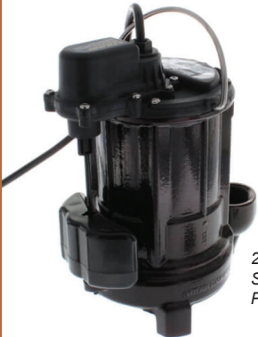
257 SUMP PUMP

Model 257 is for Sump and De-watering Applications only