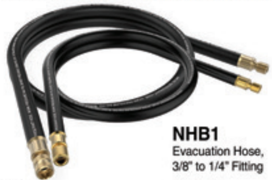
NHB1 Evacuation Hose, 3/8" to 1/4" Fitting

Redeem on www.navacglobal.com/evacuation2020/