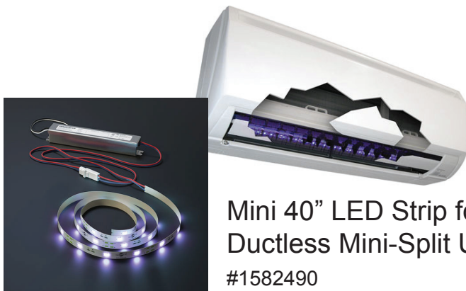
Mini 40" LED Strip for Ductless Mini-Split Units #1582490