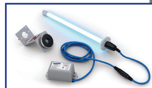
Blue-Tube Kit, single blub in duct #1582489