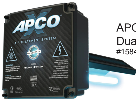
APCO TUV-APCOX-D13P Dual Lamp 120V Air Purification System #1584607