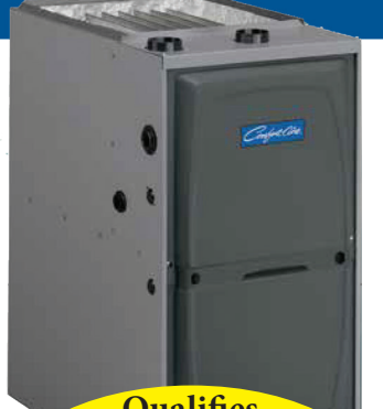
Qualifies for Energize CT $800 rebate! Talk to your Torrco salesperson today!

• Advanced Heat Exchanger: Made from stainless steel for maximum strength and crimped, rather than welded. Highly resistant to thermal fatigue and other stresses.