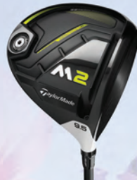
TaylorMade Driver or Wedge Set