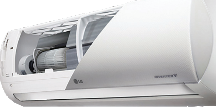
Cutaway image of LG Art Cool Premier