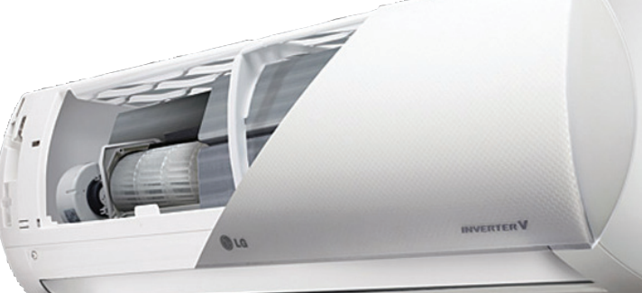
Cutaway image of LG Art Cool Premier