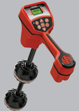
NAVITRACK® SCOUT® LOCATOR Cat. #19238