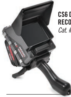
CS6 DIGITAL RECORDING MONITOR Cat. #'s 45138, 45143