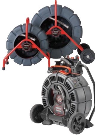
200' COLOR REEL Cat. #14053