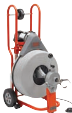
K-750 DRUM MACHINE All models