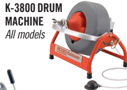
K-3800 DRUM MACHINE All models