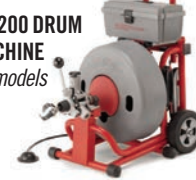
K-6200 DRUM MACHINE All models