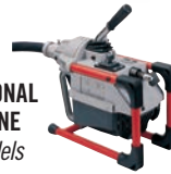
K-60 SECTIONAL MACHINE All models