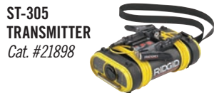
ST-305 TRANSMITTER Cat. #21898