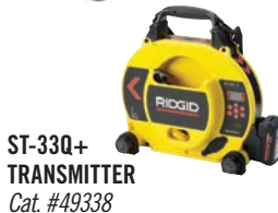
ST-33Q+ TRANSMITTER Cat. #49338