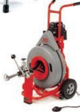
K-7500 DRUM MACHINE All models