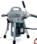
K-50 SECTIONAL MACHINE All models