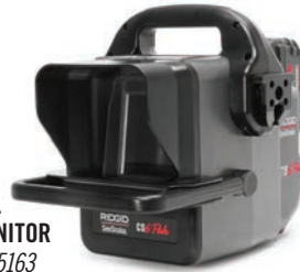
CS6PAK DIGITAL RECORDING MONITOR Cat. #'s 45158, 45163