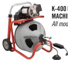
K-400 DRUM MACHINE All models