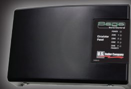
Sage Zone Control Circulator Panel