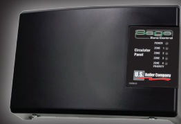
Sage Zone Control Circulator Panel